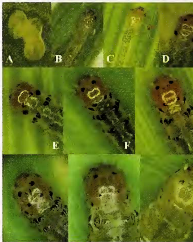
FIG. 2. Omiodes continuatalis larvae exhibit changing patterns of melanization on the prothoracic shield during nine developmental instars. A. Cluster of eggs. B. First instar. C. Second instar. D. Third instar. E. Fourth instar. F. Fifth instar. G. Sixth instar. H. Seventh instar. I. Eighth instar. J. Ninth instar.

brown in color and have a mean width of 0.35mm (range: 0.32–0.38). The reddish-brown coloration persists throughout the entire larval stage. Unlike the larvae of other Hawaiian Omiodes species which maintain bright green body coloration (Swezey 1907), O. continuatalis larval coloration is comparatively less vivid. The abdomen is a gradient of off-white to light olive, and once larvae begin feeding they acquire the approximate pigment of the vegetation they are digesting. Larvae may molt to the second instar (mean: 0.45mm, range: 0.40–0.50) and the third instar (0.64mm, 0.50–0.74mm) after three to five days. In the third instar, larvae develop a single black head spot on each of the head capsule lobes, as well as two black spots on the prothoracic shield. O. continuatalis larvae continue to molt every three to five days (4th: 0.92mm, 0.66–1.10mm; 5th: 1.28mm, 0.90–1.42mm; 6th: 1.78mm, 1.3–1.96mm), growing in size and developing more intricate patterns of melanization on the prothoracic shield, as well as tubercles on the 2nd and 3rd thoracic segments and the 7th–10th abdominal segments. During the penultimate instar (6th; 7th: 2.32mm, 1.8–2.52mm; 8th: 2.84mm, 2.34–3.56mm), O. continuatalis larvae acquire a faint pink tint, while the